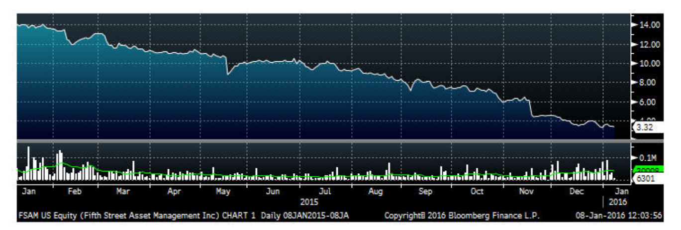
We Believe the Compensation Paid to the External Manager is Excessive

For these reasons, and others described herein, the common stock price of FSAM has plummeted. We believe that this decreasing stock price reflects the market's complete lack of confidence in the External Manager.